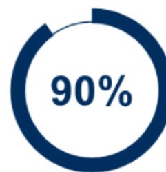
Year to Date (2021)

Hi all, we have made it just over half-way through Term 2 and our attendance is staying strong at around our 91%, even with the bout of illness we saw over the last few weeks. Hopefully all are now on the mend and ready to learn! As always let us know if you or your family are poorly and keep anyone unwell home till they are recovered.