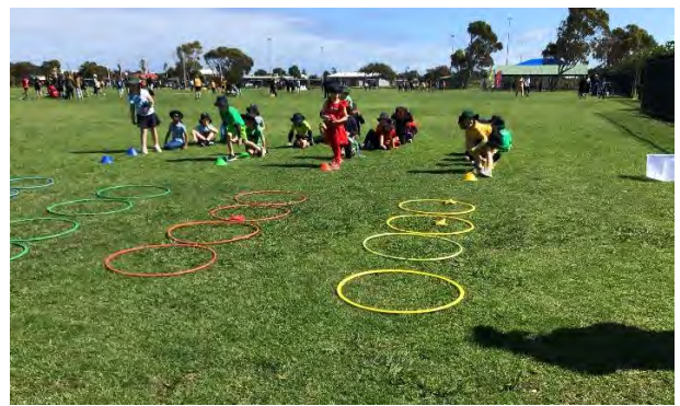
We saw lots of team work and sharing.